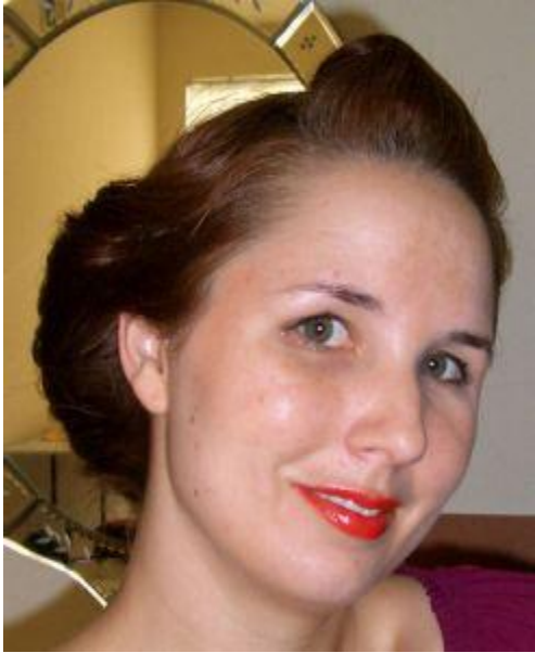
From the Front